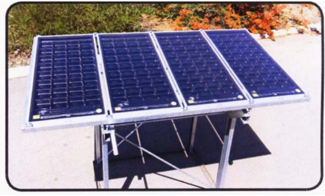
Figure 2: A single solar water purifier and an array of four purifiers