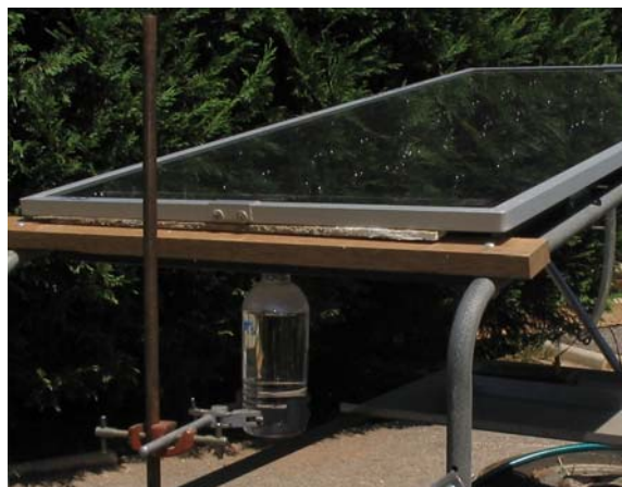
Figure 4: Showing collection detail

The 3 x 250ml bottles along with the 3 x 5 litre bottles still containing some of the original arsenic solutions were returned to the test laboratory for a determination of the arsenic content of each.